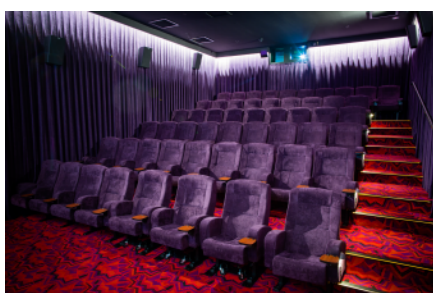
Cinema 1 (54 seats)

Align your business with style and opulence. Deluxe houses two boutique state-of-the-art luxurious cinemas screening the latest hand picked blockbusters and art house titles.